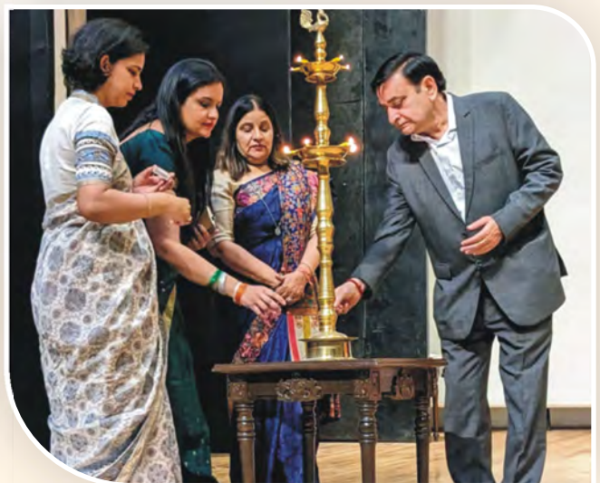
Shri Arun Gemini (Famous Hindi Poet)