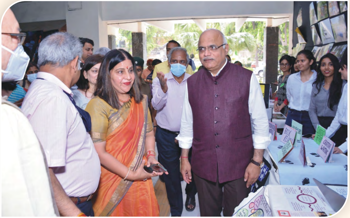
Dr. Vinay P. Sahasrabudde (President of the Indian Council for Cultural Relations)